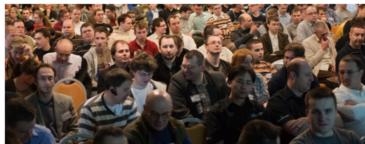
almost 700 visitors