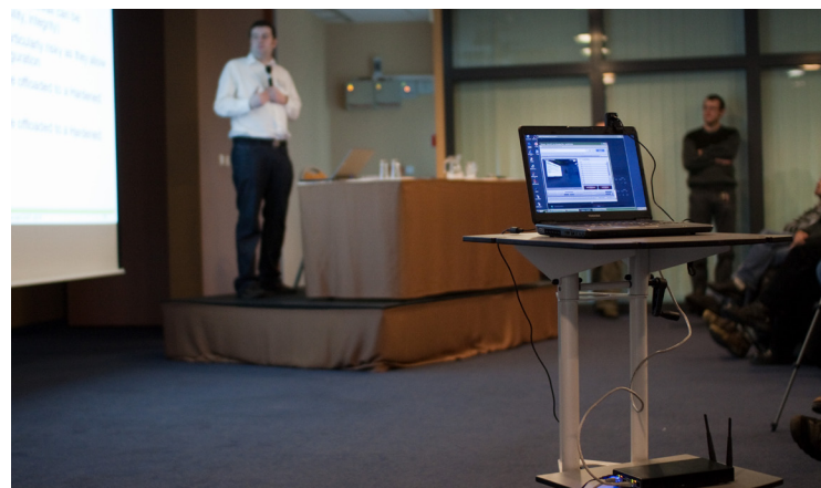
Live video stream to www.tiktube.com

As RB250GS is a switch, it can throughput data at wire speeds, ie. maximum possible.