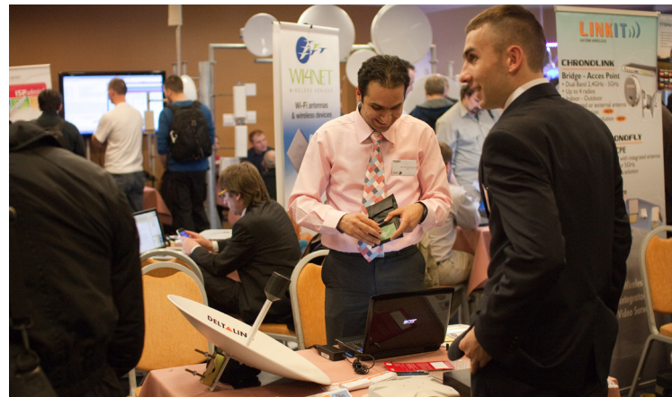
22 exhibitors of Made for MikroTik products

Also this was the first MUM which we streamed LIVE to our www.tiktube.com portal, so people can view video of the presentations at the same time as they happen. The opening was watched by more than 200 unique online viewers, and total number of unique watchers was 1641!