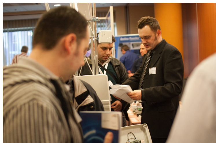
More pictures at: http://mum.mikrotik.com/gallery/